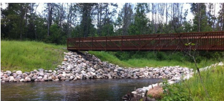
Buhl Dam after removal