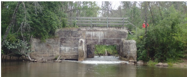
Buhl Dam before removal.

This project is part of the South Branch Pine River Watershed Restoration and Action Plan to implement critical actions that will improve watershed condition and protect the river.