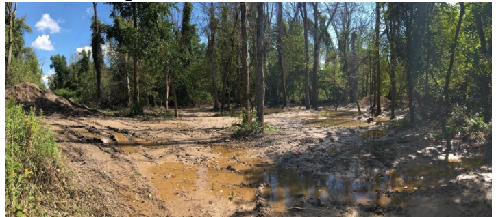
Davis Property before restoration, April 2017.

In July 2018, the Saginaw-Chippewa Indian Tribe initiated an important floodplain enhancement and streambank restoration project on their Davis Property. The goals of this project were to reduce flooding and erosion, improve natural habitat, reduce sedimentation from runoff, and create a healthy, sustainable landscape. Conifer trees were planted and secured in eroded parts of the bank for stabilization. Native wetland plant species were planted to help filter pollutants from runoff and absorb water. Overall, this beautiful, restored wetland provides an excellent example of green infrastructure to “slow the flow” of runoff, help retain stormwater, and encourage soil infiltration to reduce flooding.