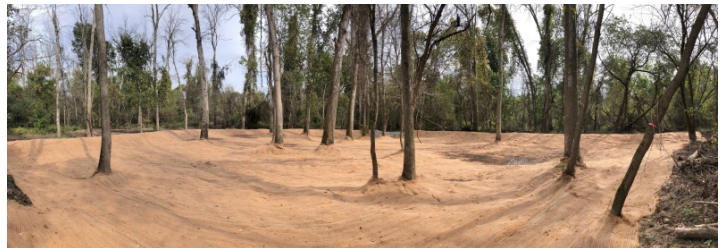
Davis Property directly after fresh plantings (but before growth), October 2018.