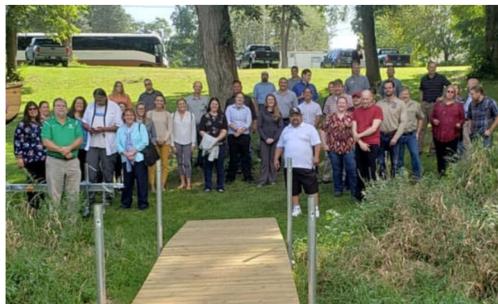
Michigan Wild Rice Initiative partners assembling

Recognizing historical and cultural practices of Tribes, a large group of State, Tribal, and individual partners came together (see picture below) to develop a plan to protect, honor, and sustain the health of Manoomin beds for the next generations. The Michigan Wild Rice Initiative (MWRI) stems from a collective understanding among State and Tribal governments that the protection and restoration of wild rice in Michigan should be elevated in importance. The MWRI was designed as a long-term, ongoing collaboration that builds on previous planning and priority-setting efforts. The State of Michigan classified Manoomin as a culturally-significant species in the Michigan Water Strategy. The MWRI is intended to be a working model for co-management of other culturally significant resources moving forward.