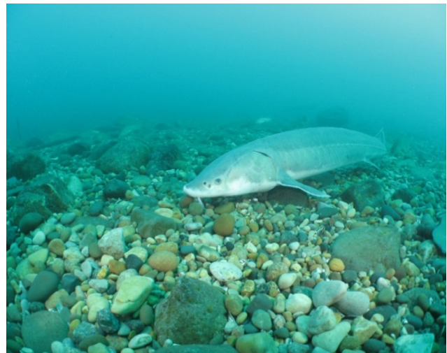
Lake Sturgeon spawning under the Sarnia to Port Huron Blue Water Bridge.

A binational team of federal, state and provincial management agencies are working with First Nations,