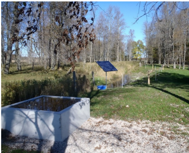
Cattle exclusion and alternate watering improves river habitat on the Bruce Peninsula.

The Bruce Peninsula Biosphere Association is one of the newest Framework members. Yet, in just three years, collaboration with cattle farmers resulted in 26 solar-powered fencing projects and watering systems that prevent over 2000 cattle from degrading streams and water quality, and at the same time improving livestock health. Building on the Lake Huron Biodiversity Conservation Strategy and Framework principles, the Biosphere Association completed a regional Conservation and Stewardship Plan to ensure a healthy future for this unique region. A conservation network of local environmental groups and municipal, provincial and federal agencies now facilitate community awareness, access to resources, and joint decision making to support projects that study, restore, and protect water quality and biodiversity. The Framework and its guiding principles have demonstrated that working collaboratively with communities and landowners leads to effective decision making and lasting conservation results. To learn more about the Framework, see www.lakehuroncommunityaction.ca .