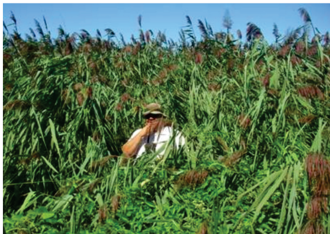
Common Reed ( Phragmites )

Two new organizations, the Great Lakes Phragmites Collaborative, based in Michigan, and the Ontario Phragmites Working Group, have emerged to educate the public and share techniques on managing the invasive reed. A new document by the Ontario Ministry of Natural resources called "Invasive Phragmites -Best Management Practices of Phragmites " is available that provides a selection of effective and environmentally safe control practices. For more information on Phragmites , see http://www.mnr.gov.on.ca/ .