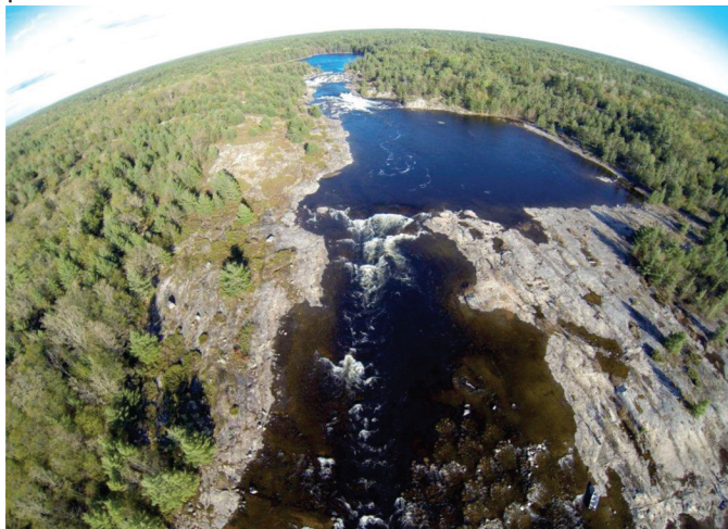
Moon River habitat restoration project

in 2013 confirmed the use of new spawning habitat by Walleye. This work is an ongoing collaborative effort with funding from the province, municipalities and private donors. The Key River is the next tributary being considered for Walleye spawning bed improvement.