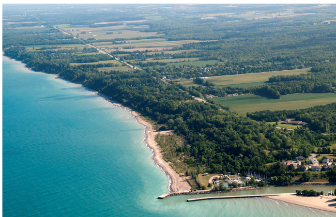
Lake Huron Southeast Shores

The Michigan Agriculture Environmental Assurance Program (MAEAP) has also been working with farmers in the Saginaw Bay watershed to identify and manage environmental risks by implementing best management practices on farmland since 2002. To date, more than 240 verifications (i.e., environmental-related assessments) have been completed in the watershed. For 2013, 11 MAEAP technicians will provide local technical assistance to the Saginaw Bay watershed.