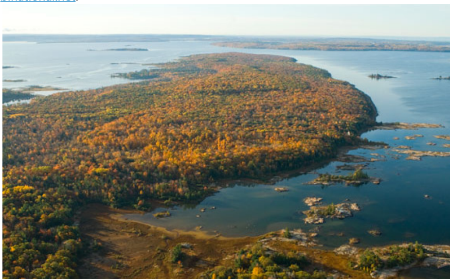
Georgian Bay

We encourage you to learn more about Lake Huron and the collaborative approaches taken to understand its ecosystem, how we are protecting high quality areas and restoring areas that have been degraded. For more information visit: www.binational.net .